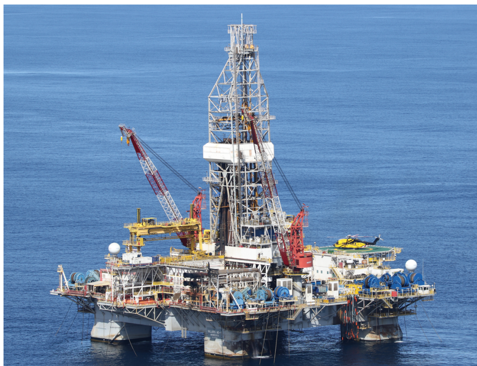
Valaris MS-1 drill rig.